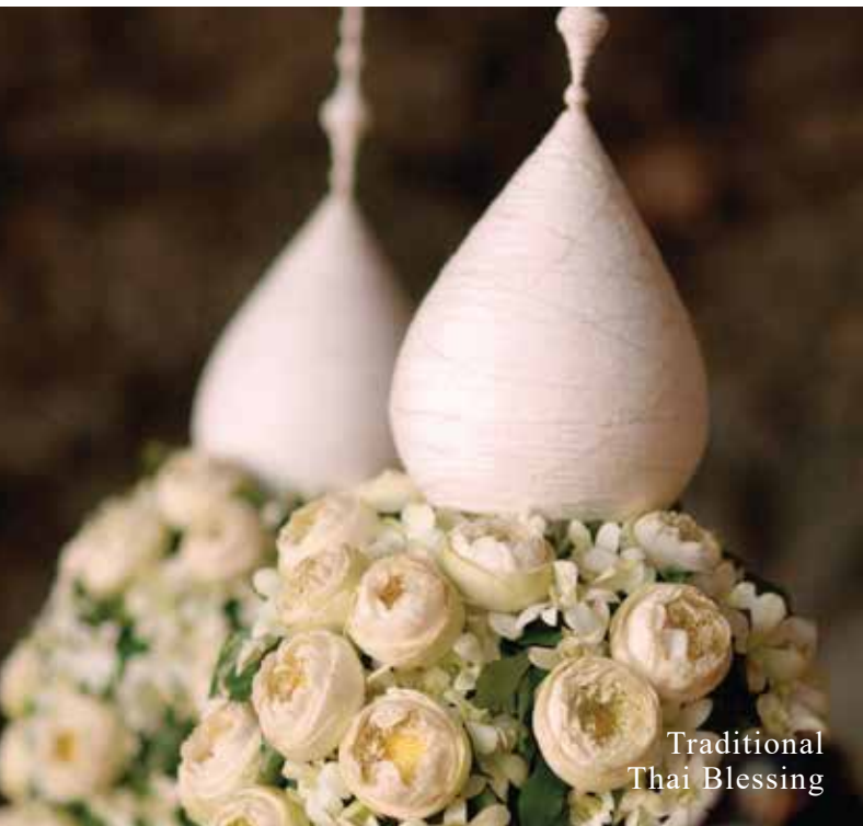
Traditional Thai Blessing